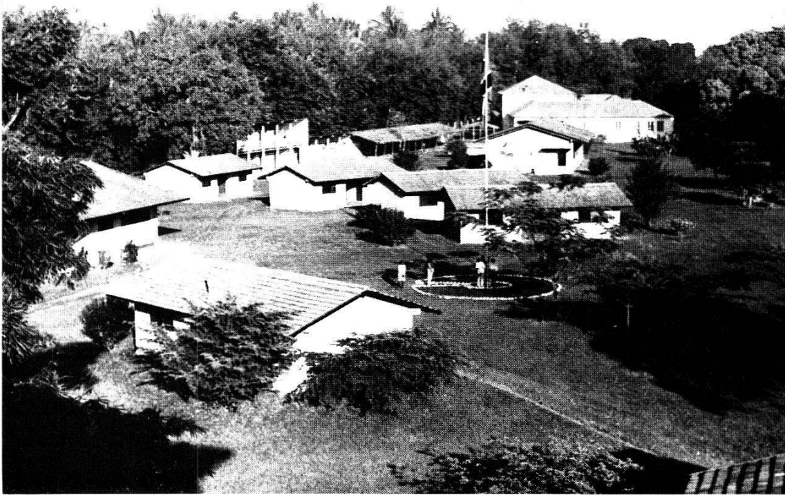
Rural Aid Centre, Ifakara.

project was submitted to President J. Nyerere, then Prime Minister. The “mwalimu” accepted the suggested creation of Rural Aid Centre as an appreciated complement to the existing training centres for medical auxiliaries, and also the choice of Ifakara, in the Ulanga Plain, as its site.