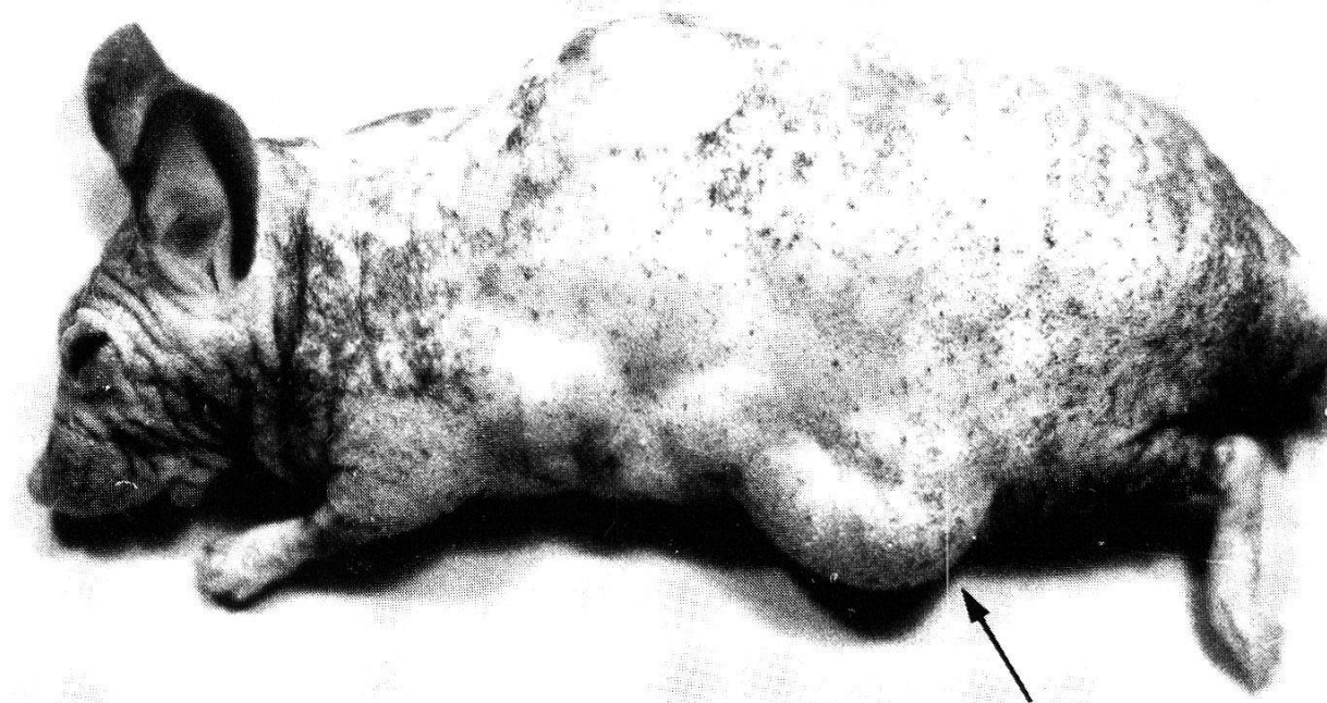
Fig. 4. Large varicosities (→) of a subcutaneous lymphatic harboring adult B. malayi from which lymph could repeatedly be aspirated, 274 days after subcutaneous inoculation with 50 L 3 .

circulating microfilariae and the syndrome was noted. As shown in Table 1, an overall 40.7% of microfilaremic and 17.1% of amicrofilaremic male mice exhibited filarial symptomatology. Conversely, 24% of microfilaremic and of 14.6% of amicrofilaremic males remained normal. Therefore, we agree with Rogers and Denham (1974), that living adult worms and not microfilariae appear to be the pathogenic stage.