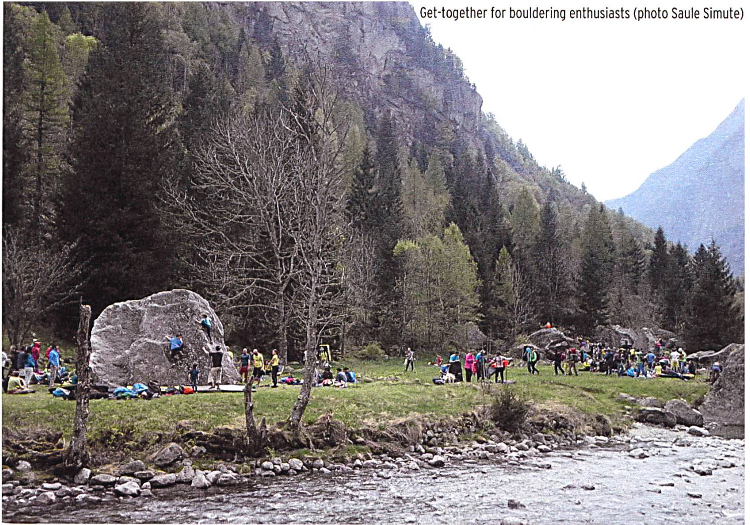
Get-together for bouldering enthusiasts