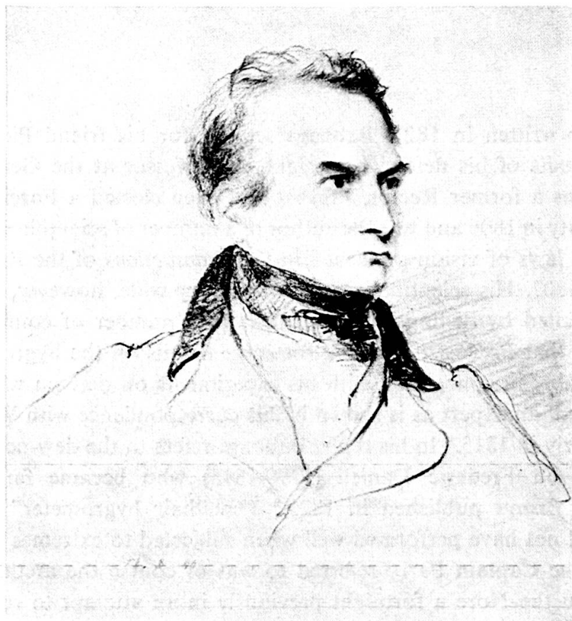
Charles Babbage, F.R.S. (1792-1871)

In 1826, Babbage had had two papers published on signs: “On a method of expressing by Signs the action of Machinery” 1 and “On the influence of Signs in Mathematical Reasoning”. 2 He was in no doubt of the importance of the universal acceptance of the same notation so that all who used the signs would speak the same language. The first of these two papers was prepared with a view to the award of the first Gold Medal awarded by the Royal Society. It was a bitter disappointment to him that his “mechanical notation” which he named it did not gain for him this award. 3