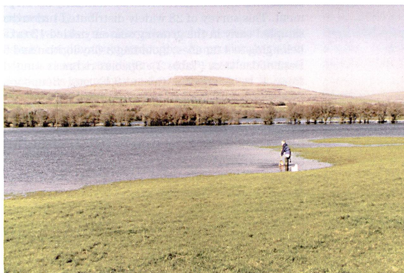
Fig. 3: Turloughmore. This recently flooded turlough in the Burren, Co. Clare, shows hedges extending into the water.

Entomostracans were sampled from the leeward side of each turlough at a depth of approximately 30 cm, and from a range of the habitats present (vegetation, open water, accumulated detritus, flooded hedgerows etc.), using a standard FBA style pond net with a 100 \mu m mesh net. Entomostracan samples consisted of 10 standard sweeps, each involving sweeping the net forwards along a one meter long path, then back along the same, disturbed path, completed in two seconds. Samples were preserved in 70% alcohol (IMS). In the laboratory any contained plant matter and macroinvertebrates were recorded and then separated from the sample using a coarse sieve. Suspended materials were concentrated with a fine sieve and their settled volume recorded. Water was added to make up to a known volume (usually 50 ml) and a sub-sample of 2.5ml was examined. Unrecognised cladocerans were mounted in lactophenol with lignin pink for identification. All cladocerans were then counted in a grooved counting disc under a binocular dissecting microscope at x200 magnification. If the sub-sample contained 100 or more of the most abundant cladoceran species, the sample was considered complete, otherwise further sub-samples were counted until a number greater than 100 of one species was recorded.