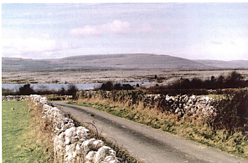
Fig. 2: Roo West turlough in karst. This SAC has high cladoceran diversity including the arctic relict cladoceran Eurycercus glacialis .