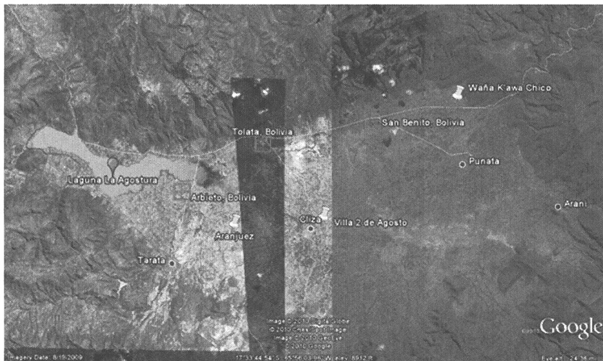
Figure 1: Communities in the Valle Alto of Cochabamba where social network analysis was performed, from July to September of 2010

The first two communities have a peach producers association. In the third one, by the time of this study, a farmers' association was created but it was no specific for peach production.