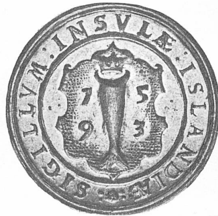
Fig. 2. Seal of 1593 (Photo: Gisli Gestsson).

Council, that exercised royal powers during the minority of Christian IV, various matters, including the granting of a seal to the country. The seal was to be kept by the governor and used on missives to the king. The State Council granted the request, and there is a letter to the governor on the subject, dated 9th May 1593, where it is declared that the Council has acceded to the request of the Icelanders and had a seal made for them, which it has handed over to the governor of Iceland, Heinrich Chrag, and moreover commissioned him to keep it and see that it be not misused.