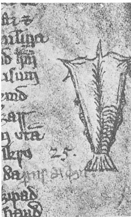
Fig. 1 Codfish as shown in the Stockholm Book.