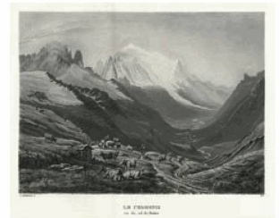
The NB is a partner in the project ViaticAlpes. Les images des Alpes dans les récits de voyage de la Renaissance au XIX e siècle ('The image of the Alps in travel writing from the Renaissance to the 19 th century'; www.unil.ch/viaticAlpes ).

The NL made a big step forward in digitisation. In addition to the above-mentioned platform Digicoord , the digitisation of newspapers was in the foreground. In French-speaking Switzerland thanks to a general agreement with Presse Suisse the digitisation of newspapers could be officialised. The NL takes part in newspaper digitisation projects in which the publisher and a cantonal or local library are also partners. The first such endeavour being handled according to this principle was the Journal de Genève . Since December 2008 it has been available online free-of-charge. 10 The publisher Le Temps was responsible for project management and a further project partner was the Bibliothèque de Genève. In addition to financial support, the NL made its expert knowledge and experience available. Agreements for the digitisation of the Gazette de Lausanne as well as the Neuchâtel newspapers L'Express and L'Impartial have been signed during the year under review.