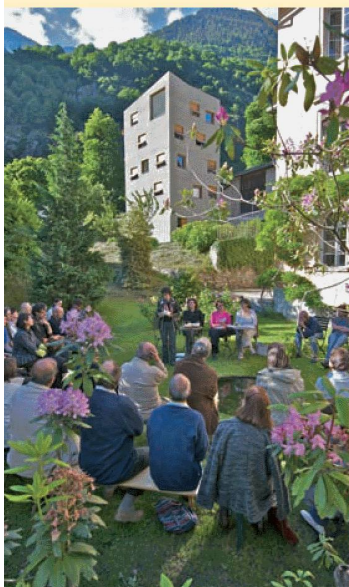
Opening Reception Quarto Bergell

The poetry of Andri Peer is considered as modern, difficult, not uncommonly even as incomprehensible. The symposium in Lavin aimed to show that his lyrics also derive from tradition and offer manifold interpretations. The event was a co-production of La Vouta, the Swiss National Science Foundation, the University of Zurich and the SLA.