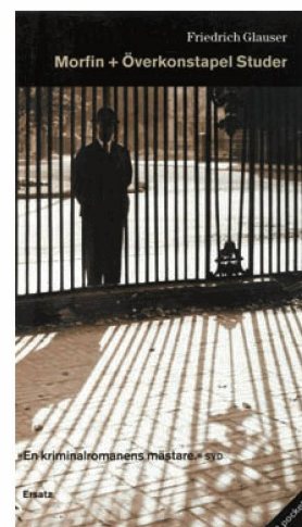
Friedrich Glauser's Wachtmeister Studer in Swedish: Stockholm, Ersatz, 2008, Sig. N 290626

A further advance in standardisation comes in the form of the German National Library's Gemeinsame Normdatei (GND, Combined authority files), which combines the various cataloguing regulations into a single entity. From early 2012, the GND will be introduced for subject indexing. There are also plans to use it for alphabetical cataloguing, but further studies will be required before this is implemented. The GND will also replace the Schlagwortnormdatei (SWD, Keyword authority control), for which the only Swiss clearing house has long been run by the NL. The major academic libraries of German-speaking Switzerland established their own SWD clearing houses during 2011.