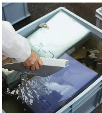
Disaster contingency plan exercise, 5.7.2017