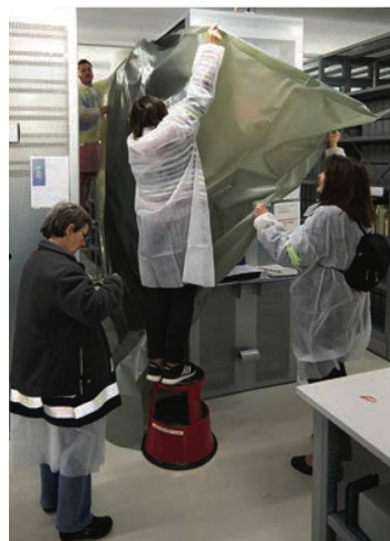
Disaster contingency plan exercise, 5.7.2017

To prepare for the migration, data quality in the applications affected was tested, and the data were cleansed where necessary. They are now all coded in accordance with the international standard MARC21 and correctly linked to the combined authority file GND. Both are requirements for the migration and also for interoperability of the NL's data.