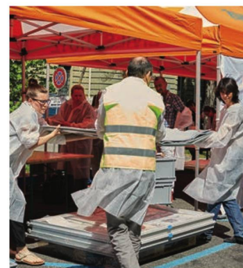
Disaster contingency plan exercise, 5.7.2017