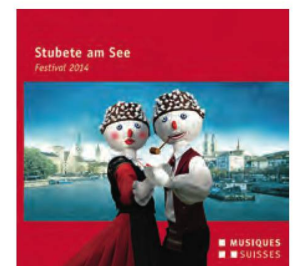
Stubete am See