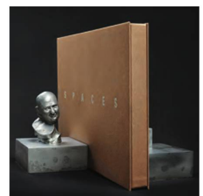
Urs Lüthi, Serre-livres (Bookends) , 2011