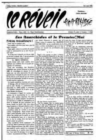
Réveil anarchiste, 01.05.1960

As part of work to develop the new strategy, particular attention was devoted to activities relevant to its implementation. These included a redesign of e-Helvetica Access , the system for accessing digital documents. For the first time, a crowdsourcing exercise was carried out, whereby private individuals helped to improve the results of newspaper digitisation. The exhibition Von oben. Spelterinis Ballon und die Drohne took the NL's collections as the basis for a virtual-reality balloon ride experience.