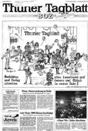
Thuner Tagblatt, 31.12.1999

The General Collection's activities and results were primarily shaped by three factors: work on the new library management system, the impact of the building situation, and alignment with the new strategy that comes into force in 2020.