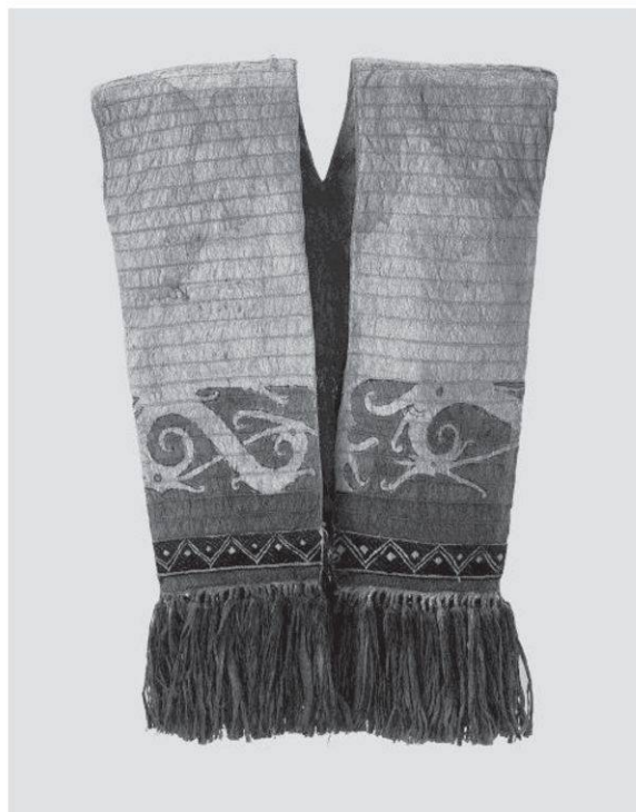
Illustration 12: Dayak bark-cloth jacket, Leupold donation, Ethnographic Museum of the University of Zurich

museum collections: four outstanding bark-cloth jackets that proved of eminent value for our research, in particular from our biographical perspective (Ill. 12).