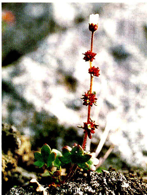
Fig. 2. Saxifraga cernua produces normally one white, terminal flower and red, lateral bulbils partly with young leaves. It is polyploid and reproduces almost exclusively asexually by bulbils. Flowers setting seeds have been observed in Scandinavia. Saxifraga cernua is circumpolar distributed with several relict populations in the Alps.