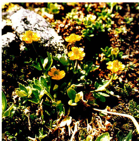
Fig. 3. Ranunculus pygmaeus is about 5 cm tall, leaves are three to five lobed, flowers yellow. It is diploid, produces no runners and reproduces only by seeds. Ranunculus pygmaeus is circumpolar distributed with one relict population in the Swiss Alps and several populations in the Austrian and Italian Alps.