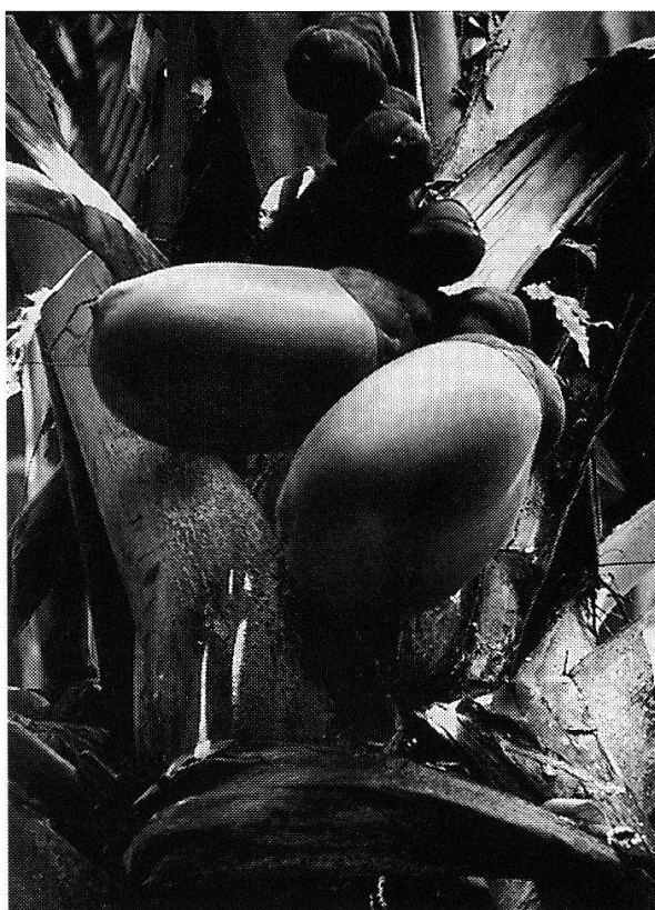
Fig. 6. Infructescence of Lodoicea maldivica in the national park Vallée de Mai (Praslin).

Our study area was in the famous forest reserve of Vallée de Mai. We made a detailed stand structure analysis on six permanent plots (each 20 m x 20 m) which were established in 1985 by an expedition from Oxford