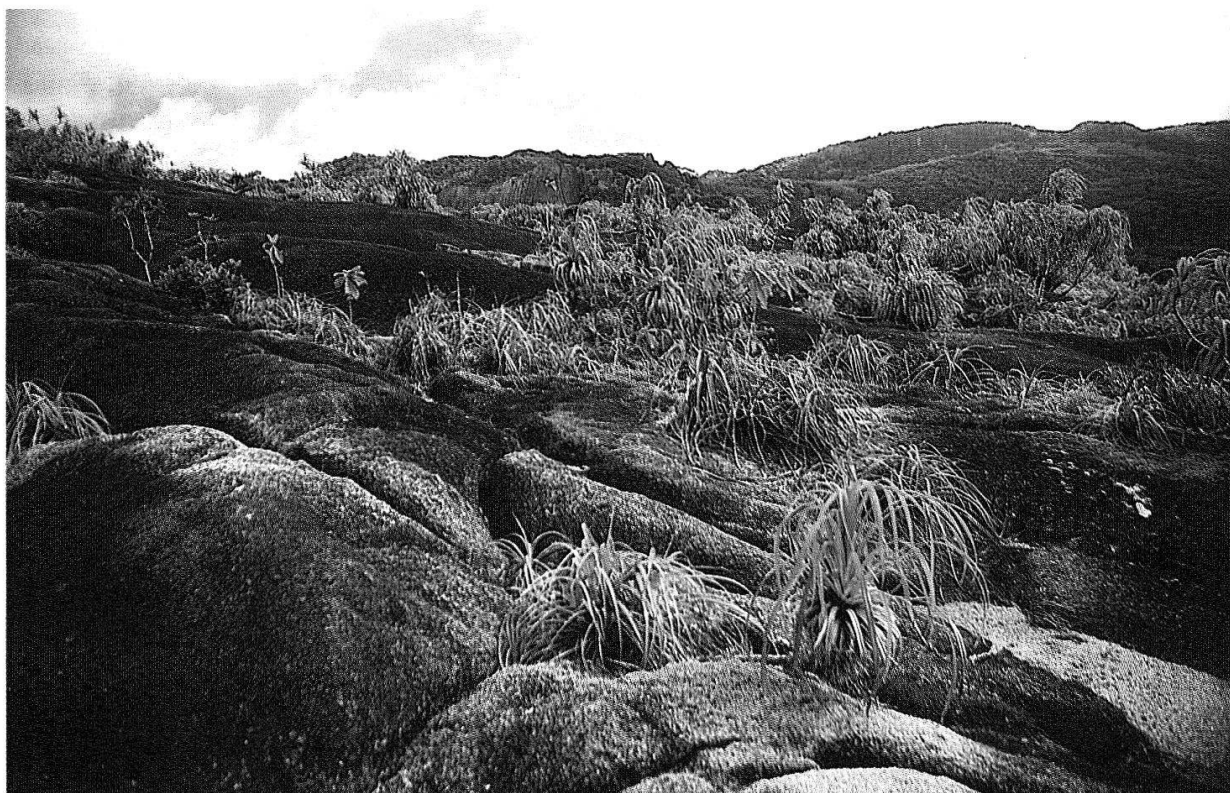
Fig. 3. Sparse glacial vegetation on the inselberg Mont Sébert ( Lophoschoenus hornei , Pandanus multispicatus , and the invasive Alstonia macrophylla ).