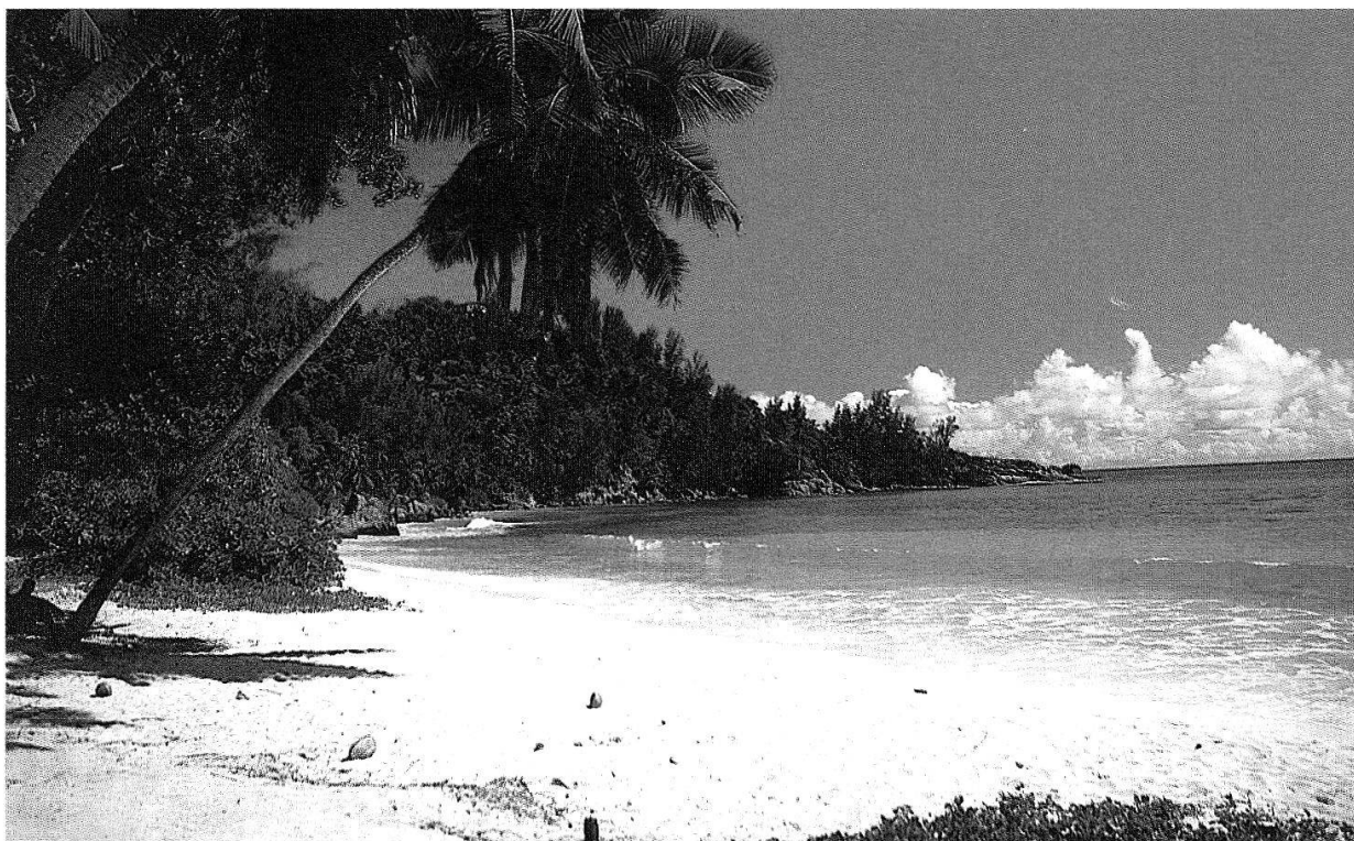
Fig. 2. Coastal vegetation on Mahé at Anse Intendance. Typical for the coastal plain are (partly abandoned) coconut plantations and scattered stands of Calophyllum inophyllum , Casuarina equisetifolia and Guettarda speciosa . Scaevola sericea forms a band of dense scrub close to the beach, fringed by the beautiful creeper Ipomea pes-caprae .