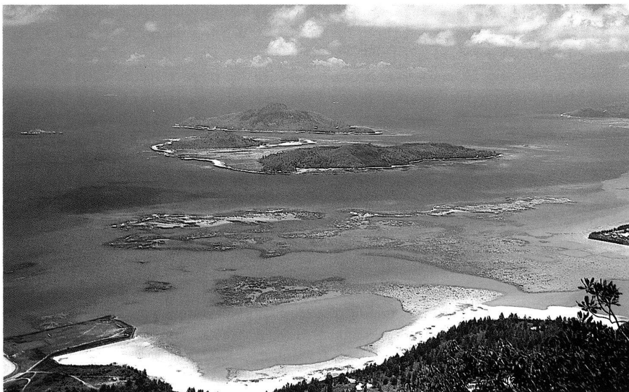
Fig. 4. View from Mont Sébert over the islands Île de Cerf and Île Ste Anne, northeast of Victoria.