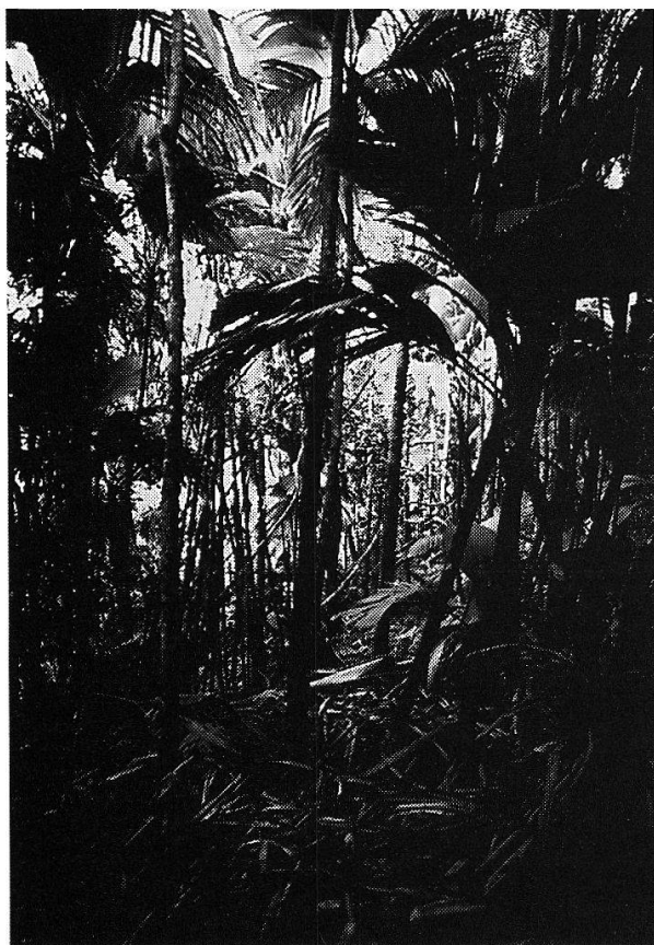
Fig. 1. Palm-rich mountain forest in La Réserve. Phoenicophorium borsigianum was the most prominent species; the palm trees produce a dense litter layer which apparently inhibited recruitment of other tree species.

cies were found. These trees, together with the endemic palms, must have been the dominant canopy species in the original forests, but today they are substituted in many places by the introduced Adenanthera pavonina , Sandoricum indicum and Albizia falcata . To assess the degree of invasion by neophytes ( Cinnamomum verum , Chrysobalanus icaco , Psidium littorale ), we surveyed the occurrence of adults and seedlings of all woody species along a trail transect of over 800 m in length.