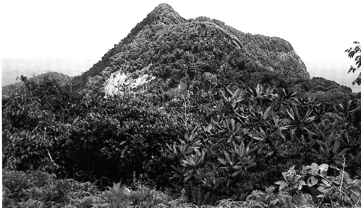
Fig. 5. View from Pot à Eau to Mont Dauban (Silhouette). Conspicuous plants are Dillenia ferruginea, Northea hornei, Glionnetia sericea, Cinnamomum verum and Dicranopteris linearis.