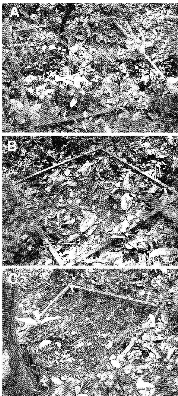
Fig. 3. Experimental plots of the removal experiment in an intermediate forest in Mare aux Cochons immediately after setting up the experiment. The three plots (each 1 m x 1 m) were randomly assigned to three treatments, i.e. (a) control, typical seedling community dominated by Cinnamomum verum , (b) seedling removal treatment, and (c) seedling and litter removal treatment.

ling communities is monitored in slope versus ridge position. The experiment includes two treatments: water addition and control.