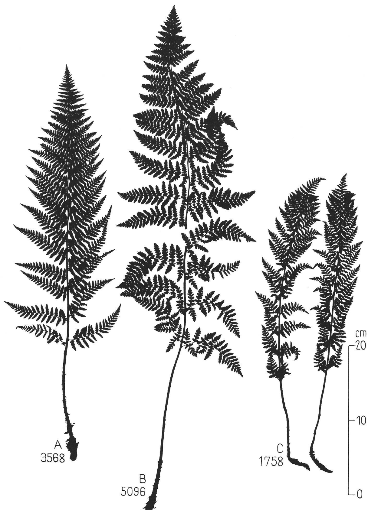
Fig. 2. Silhouettes of fronds. A = D. submontana (tetraploid), TR-3568, Caussols, France; B = D. villarii (diploid), TR-5096, big frond from locus classicus ; C = D. villarii (diploid), TR-1758, two fronds from Switzerland, Ct. Nidwalden, near Trübsee above Engelberg.