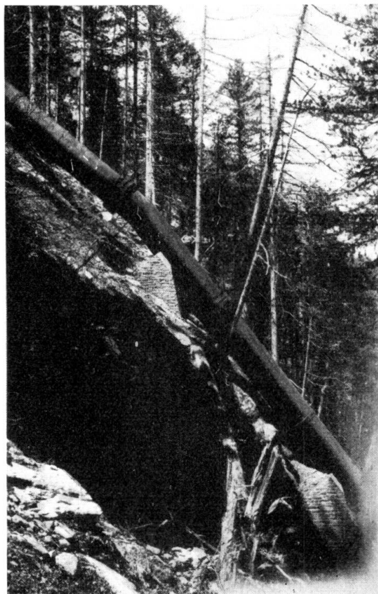
Fig. 2. Water-gas welded portion of pipeline at level 1810.

Advantage is taken of the annealing operation to place the red hot tube in a special re-shaping machine. This operation is effected very rapidly because it must be terminated before the temperature of the tube drops below 500^{\circ} . After