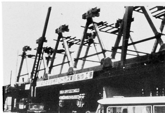
Fig. 3 — Assembly of upper chords for truss bridge.

Each of the six papers which I have just described provides information useful for solving the respective problems involved. However, the methods of designing and constructing a precast structure will differ greatly depending on the purpose for which the structure is used, the size of the structure, the topography, the geology, and other conditions of the jobsite. Accordingly, the problems discussed in these papers comprise only an extremely small part of the whole and there is naturally a considerable number of important problems remaining to be taken up.