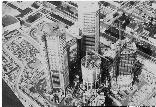
DETROIT RENAISSANCE: This is a very large and complex project consisting of a 70-story concrete structure hotel, four 39-story steel structure office buildings connected with a 7-story concrete podium for parking and commercial space.