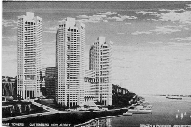
SUMMIT TOWERS: The complex consists of three 44-story apartment buildings connected by a 12-story base structure for parking, a theatre, commercial space and recreation facilities.