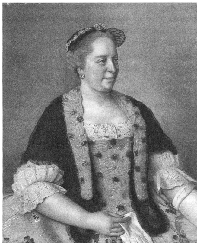
Fig. 3 Jean-Etienne Liotard, Maria Theresa, Empress of the Holy Roman Empire (1717-80), 1762, pastel on parchment, 890 × 725 mm.