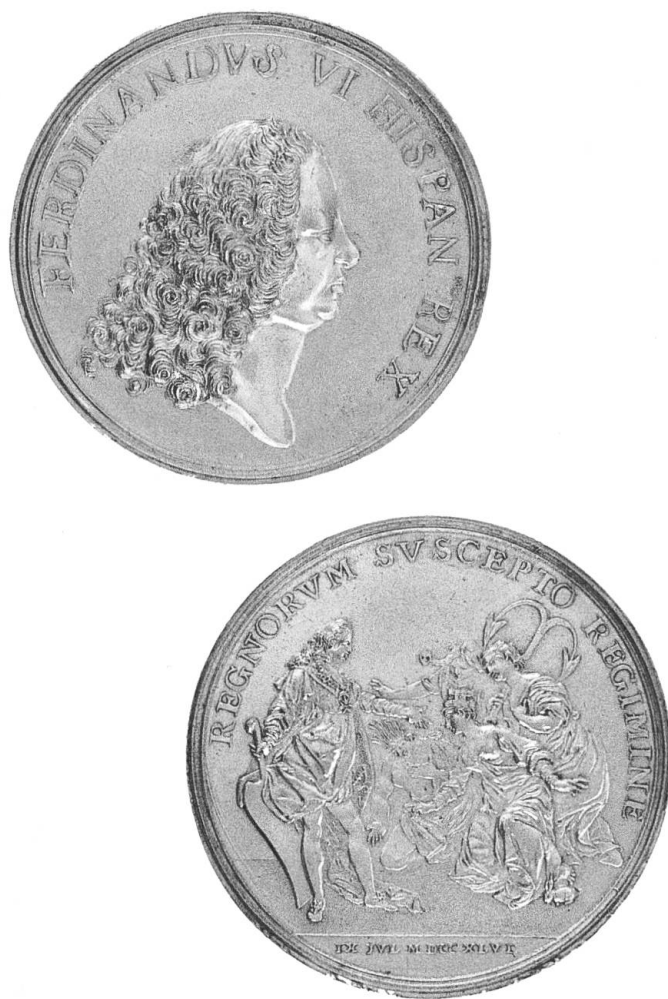
Fig. 2 Carlos Casanova, Ferdinand VI, King of Spain (1713-59), takes possession of the kingdom, 1746 , silver, 52 mm. © Madrid, Museo Nacional del Prado, inv. no. 001236

In Spain as in every European court the medal commemorating the commencement of a reign was a work of primary political and diplomatic importance. The acceptance of Dassier's work as the official medallic image of the new king reflects the court's appreciation of Genevan expertise. No doubt Ensenada was especially impressed by the medal and sought to employ it within his program of reform in the arts, sciences and manufacture. Its appearance in Madrid at this critical moment undoubtedly influenced his decision to extend an invitation to Dassier's friend Jacques-François Deluc three years later.