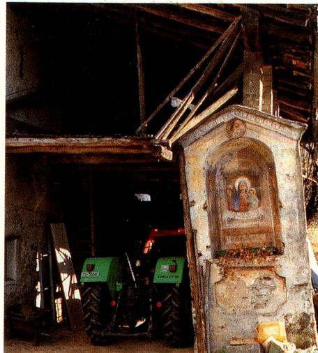
Agriculture has become marginal in today's Ticino.

As far as ideas and intentions are concerned, the canton Ticino is the model pupil in regional planning. The Ticino government was not satisfied with working out the cantonal regional plan according to the federal directives, as was the case in many cantons. The regional plan, which establishes what may be built where, and where the countryside is to be left untouched, is decided in Ticino by parliament. The democratic right of co-determination goes as far as making it possible for the Ticino people to send the result of years of work down the drain in a referendum. It has not come to this so far. The Ticino Government presented the regional plan in 1984, and they have been working on it ever since, but it has not been submitted to parliament yet. The political will to make clear principles is lacking, as the number of landowners is indeed large. The planners must be satisfied with belatedly legitimising the spreading growth of the settlements and industrial areas.