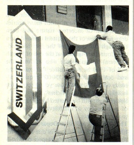
Every year, OSEC organises official Swiss participation in more than thirty trade fairs and exhibitions abroad.

Founded in 1927, OSEC has the legal form of a private association. Acting as a link between national foreign trade policy on the one hand and commercial activities in the private sector on the other, OSEC performs the function of a "turntable" in relation to the promotion of exports. It fulfils its tasks in close collaboration with the leading commercial associations, with the Federal Office for Foreign Trade, as well as with the embassies and consulates and the Swiss chambers of commerce in foreign countries. OSEC centres its range of services on the