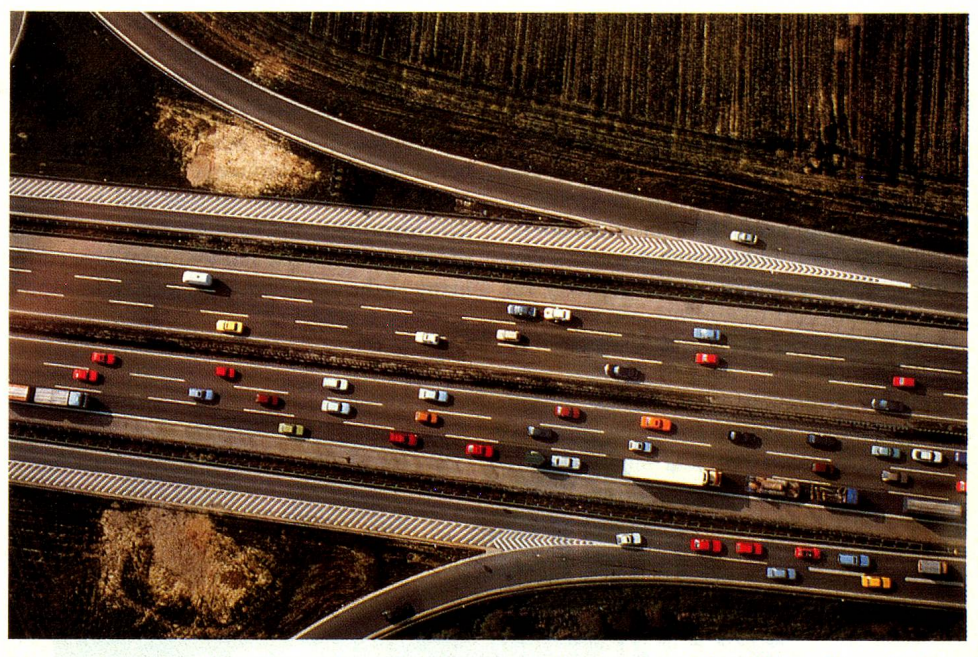
Motorways channel traffic and are five times safer than main roads.

want to make their view abundantly clear that alongside of the promotion of good public transport, the still uncompleted sections of our national highways should be finished in a determined and purposeful manner, so as to guarantee the smoothest possible flow of traffic, with if need be, an expansion of the motorway networks. Likewise, on the main roads of all the cantons, existing bottlenecks must be remedied without delay in the interest of local residents and other road