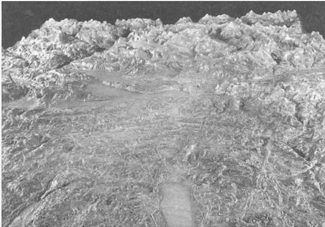
Figure 4: Relief-Map of Lake of Four Cantons, by Franz Ludwig Pfyster von Wyher (1716–1802)

with the pleasure of domination.” 36 Wordsworth makes a similar observation, claiming that by overlooking the scenery from a “little platform,” which reproduces the effect both of Picturesque tourism and of prospect poetry, the spectator receives aesthetic pleasure, “exquisite delight to the imagination,” but also, and more importantly, utilitarian pleasure by apprehending all the landscape “at once.” 37