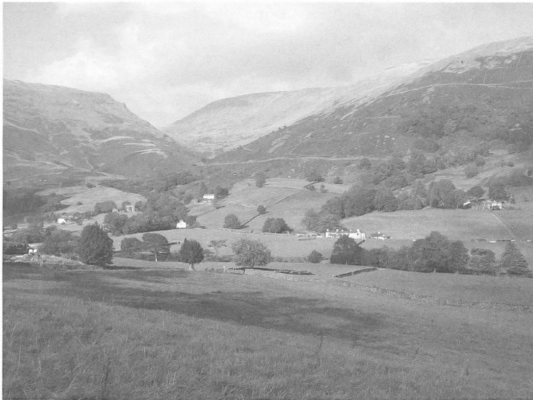
Figure 3: Estate Farms in Grasmere Valley

The word “prospect” points back to the prospect poem tradition, poetry that describes the surrounding physical world from a single perspective in order to symbolically confer authority on the landowner. As Tim Fulford has argued, “Home at Grasmere” usurps the power of the landowner, but also of the local inhabitants, in order to empower the poet himself. This authority is not based on actual ownership, but on the spiritual possession of place. 33 The passage reminds us, however, that the poem also usurps the authority of Switzerland’s landscape. No longer is it the shepherd, or even the huts who lord over and possess the vale: it is the poet-traveller who is given that prerogative thanks to his aesthetic training, described in his aesthetic fragment as a gradual opening of the mind from the perception of sublimity to that of beauty. 34 An appreciation of the Beautiful, for the later Wordsworth, reflects a viewer’s maturity.