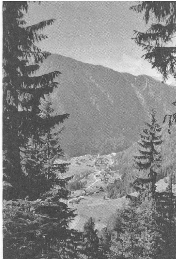
Figure 2: Vale of Trient, above Martigny (VS)