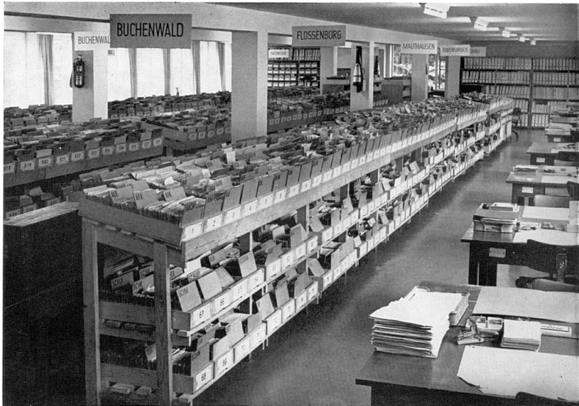
A part of the huge card-index