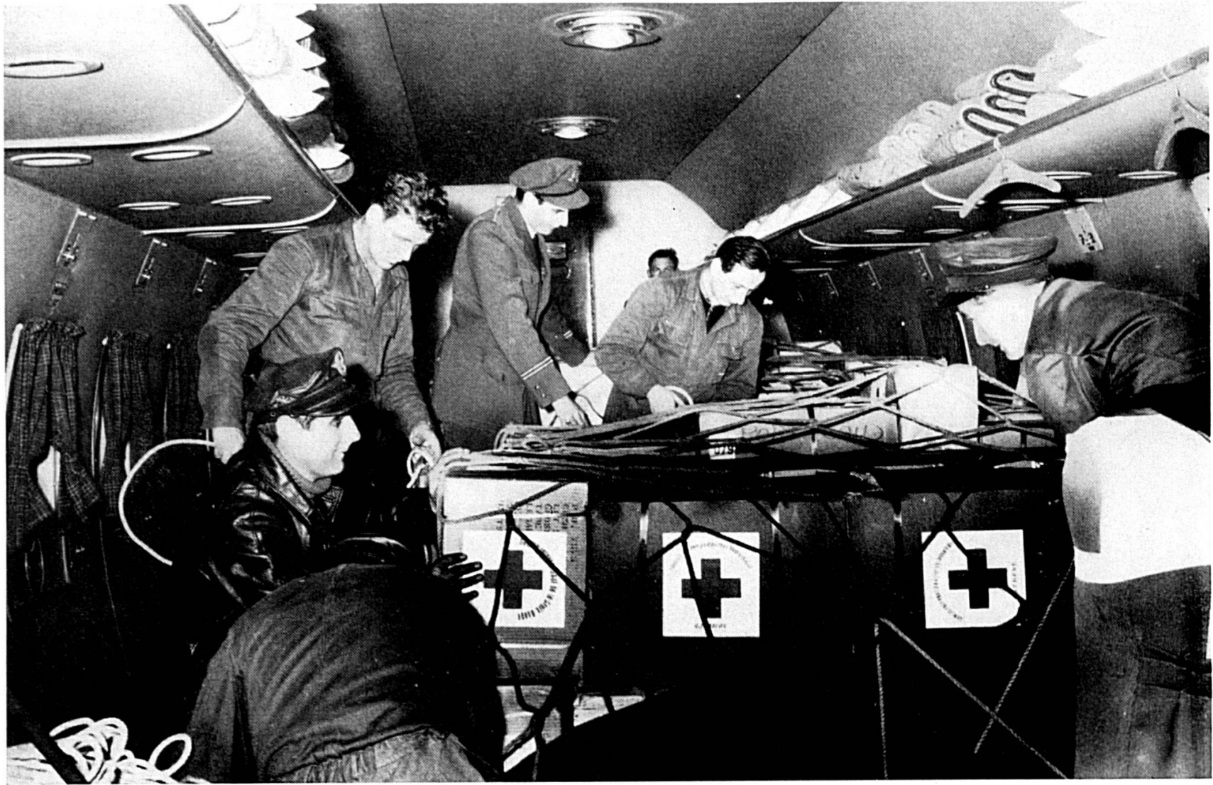
Cointrin Airport, Geneva : November 11, 1956 : five tons of medicaments for Egypt being stowed on the plane chartered by the ICRC