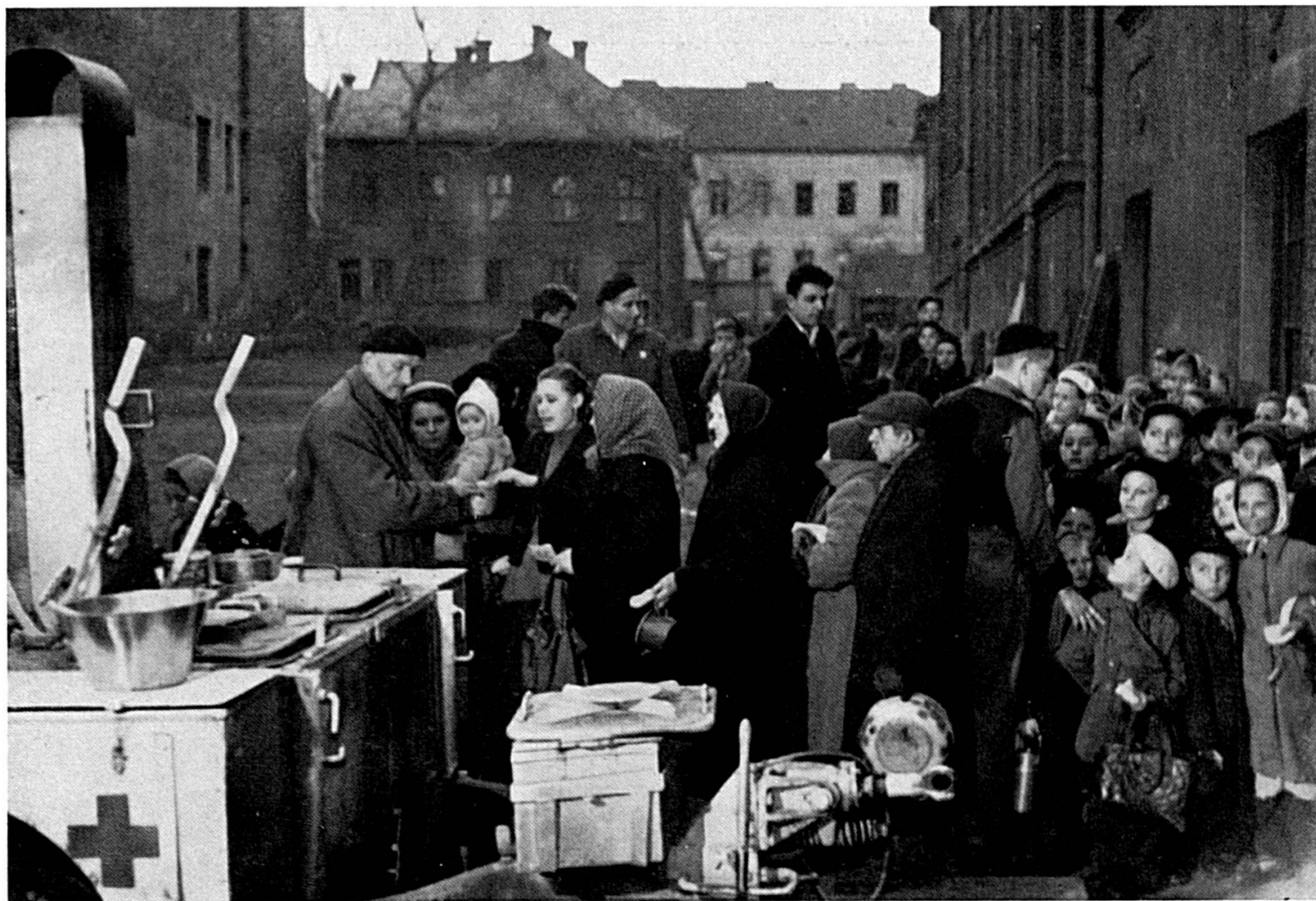
A field-kitchen set up by the ICRC in a Budapest street supplied daily meals for 300 persons