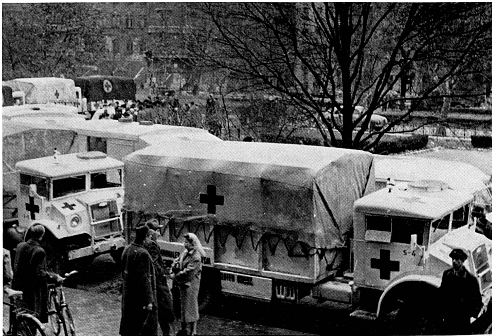
ICRC relief convoy arriving in Budapest