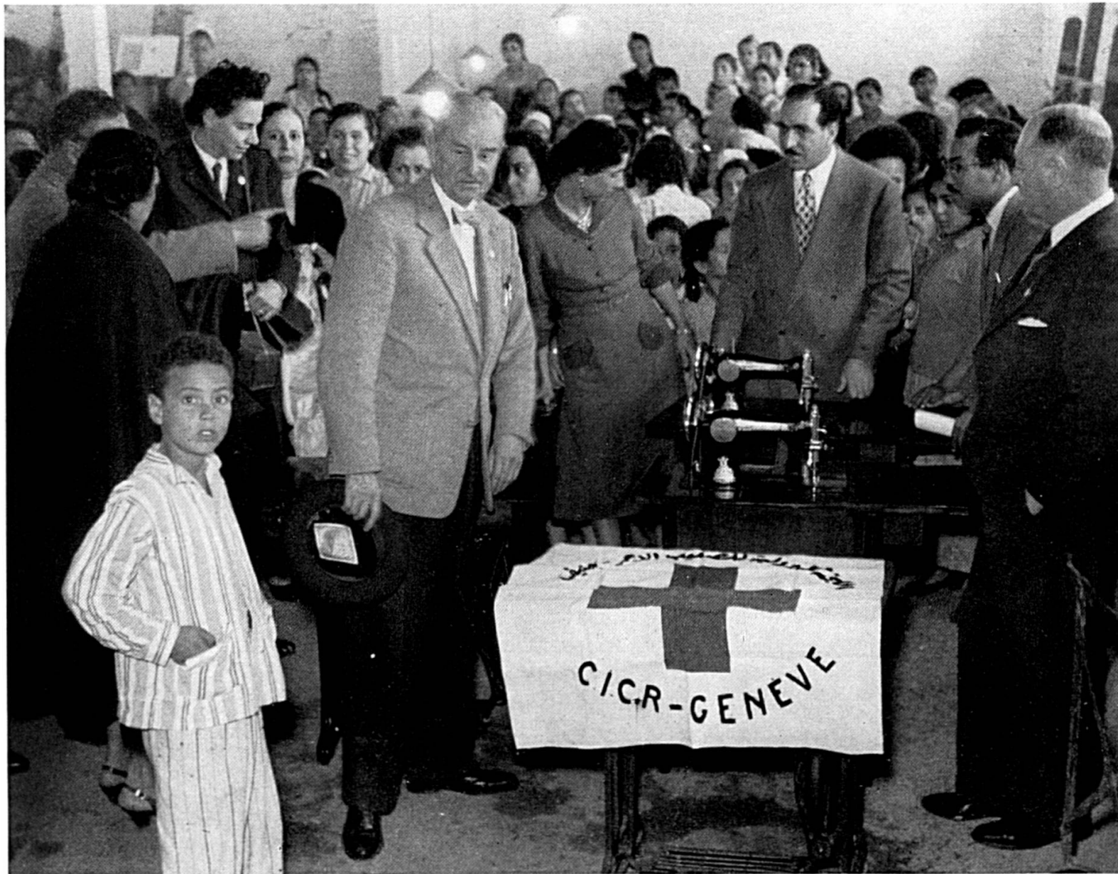
Delegates of the ICRC handing over a sewing-machine to the Port Said victims' camp workshop