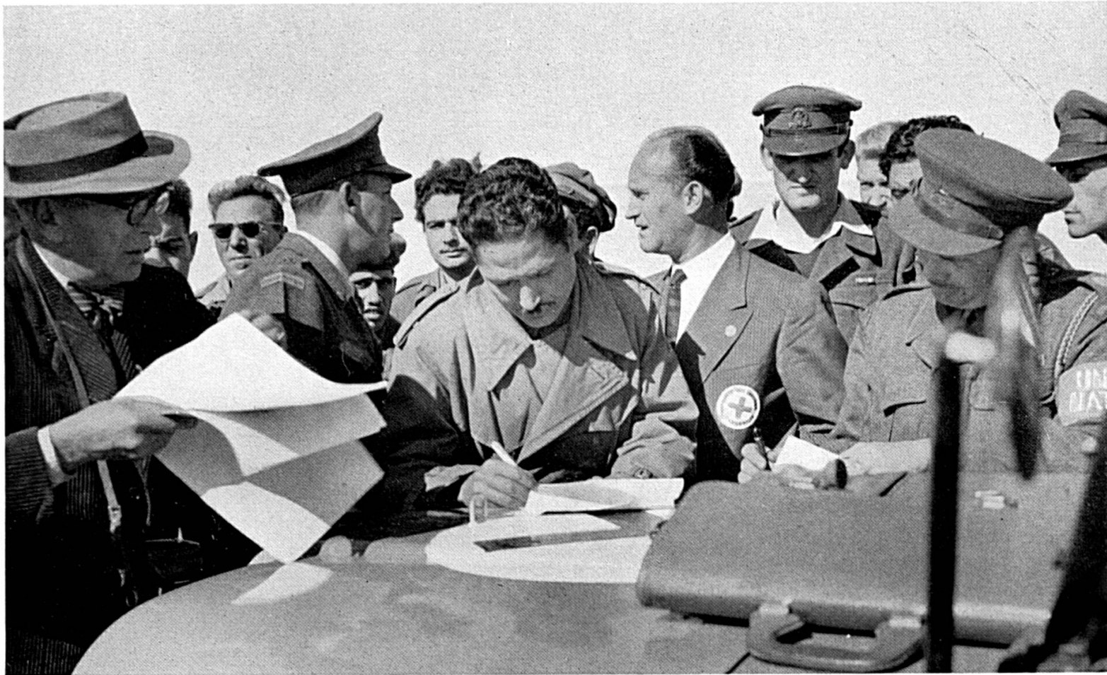
Delegates of the ICRC making final arrangements for the repatriation of prisoners of war