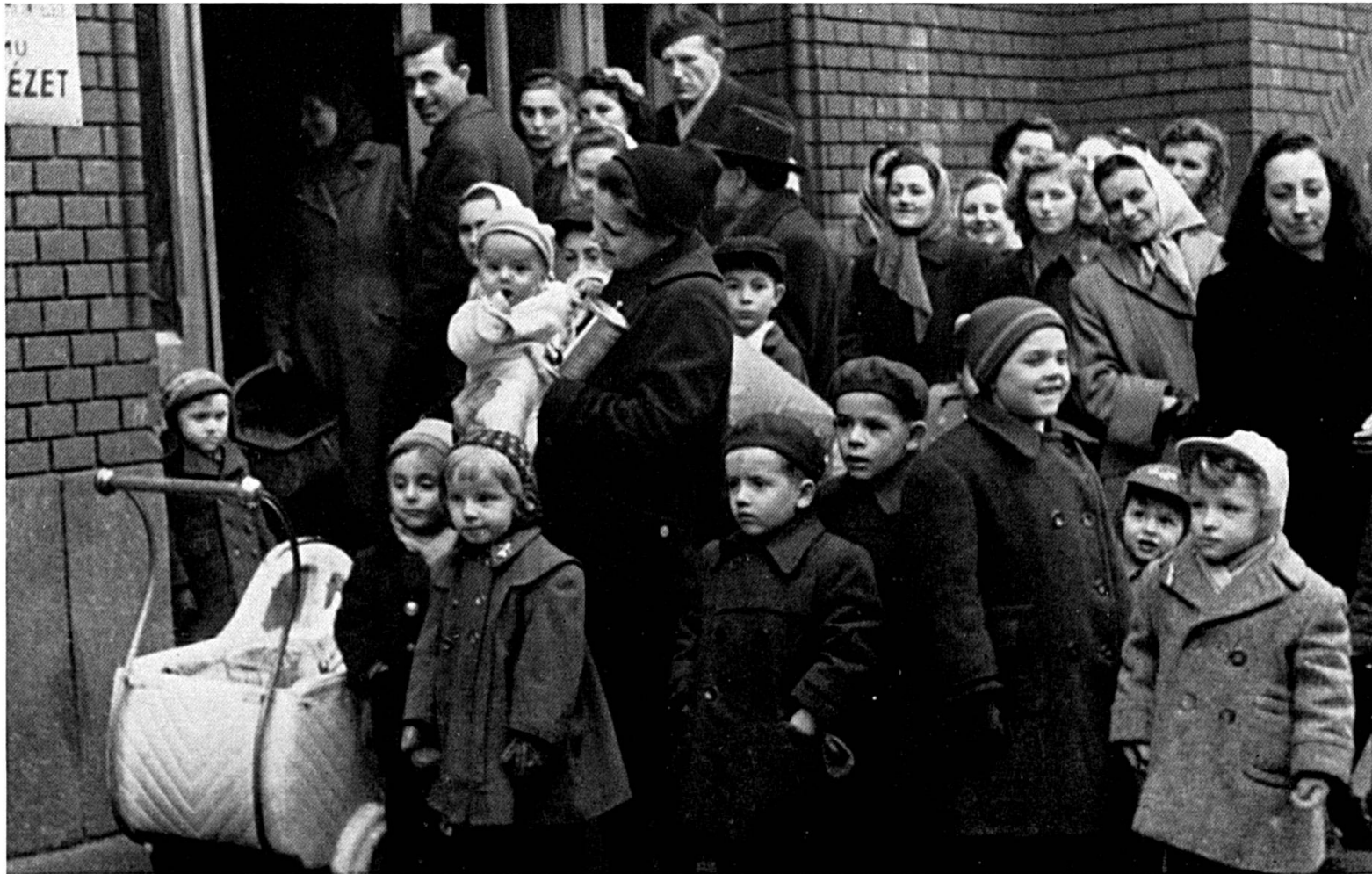
A distribution centre of the Hungarian Red Cross in Budapest