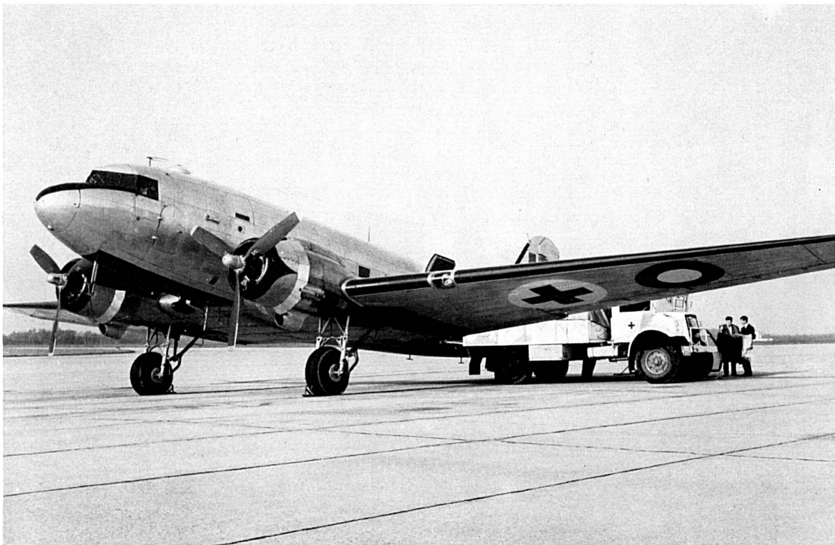
Cointrin Airport, Geneva : November 18, 1956 ; loading a plane placed at the disposal of the ICRC by the Danish Red Cross