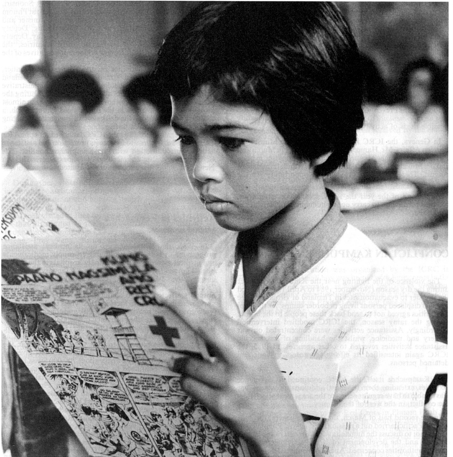
Dissemination of the principles of the Red Cross by means of cartoon strips in a Philippines school.