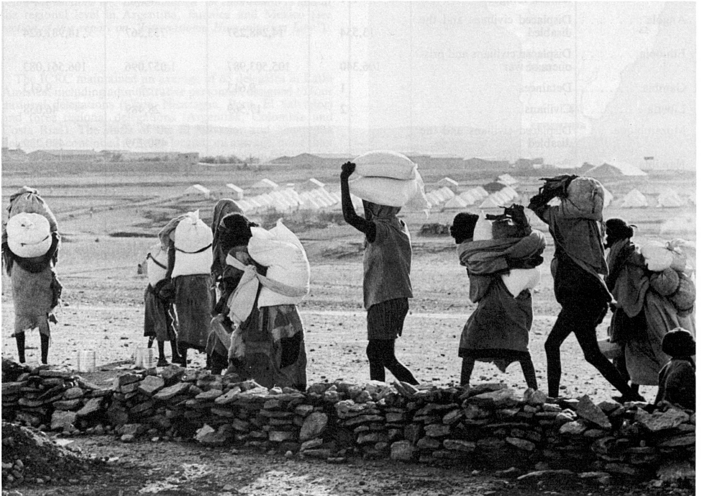
Ethiopia: Displaced persons returning to their villages after the distribution of food supplies.

and Sierra Leone provided an opportunity above all to discuss the question of the Additional Protocols of 1977 in order to further the process of accession to these instruments (Senegal ratified the Additional Protocols on 7 May 1985). From 9 to 13 December, two ICRC delegates took part in an initial seminar on the law of war for senior officers in the Sierra Leonean armed forces, which was organized jointly by the National Society and the ICRC.