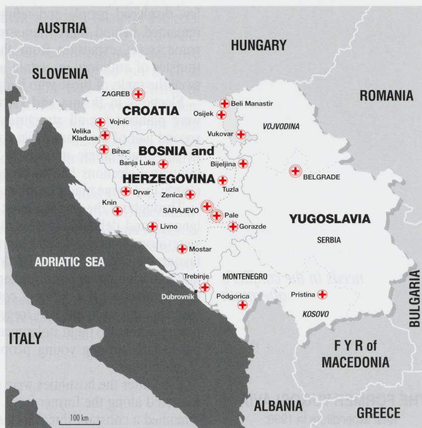
+ ICRC delegation ■ ICRC sub-delegation/office Eastern Slavonia Inter-Entity Boundary Line

Restoration of freedom of movement, one of the mainstays of the Accord, which would have allowed some two million refugees and displaced persons to return to their places of origin, turned out to be utopian, at least in the short term. Because of the security situation and the threat of discrimination, only a