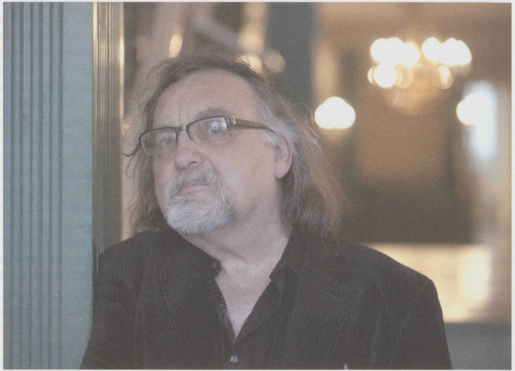
Brian Ferneyhough, 2012.