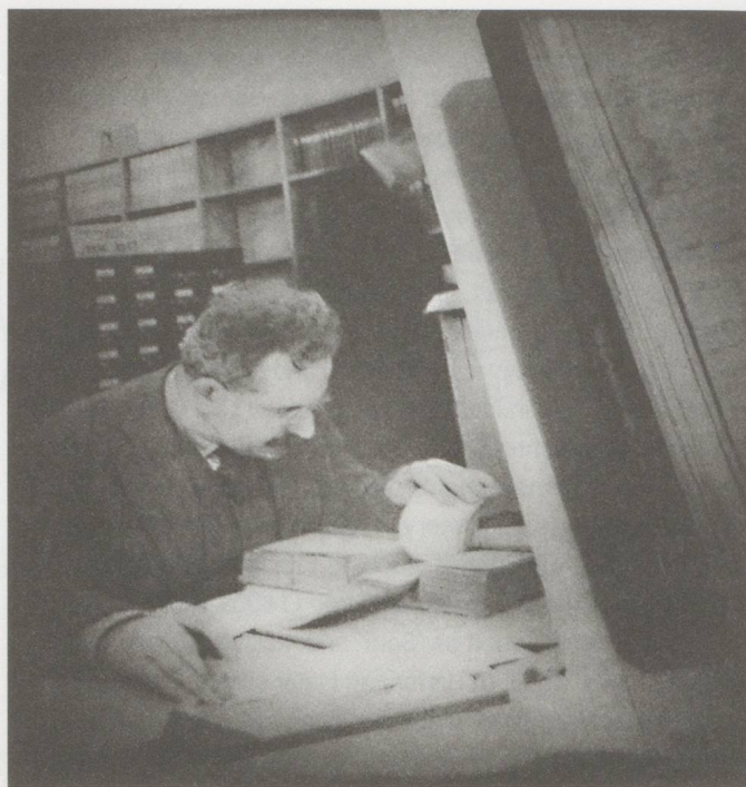
Walter Benjamin in Paris.