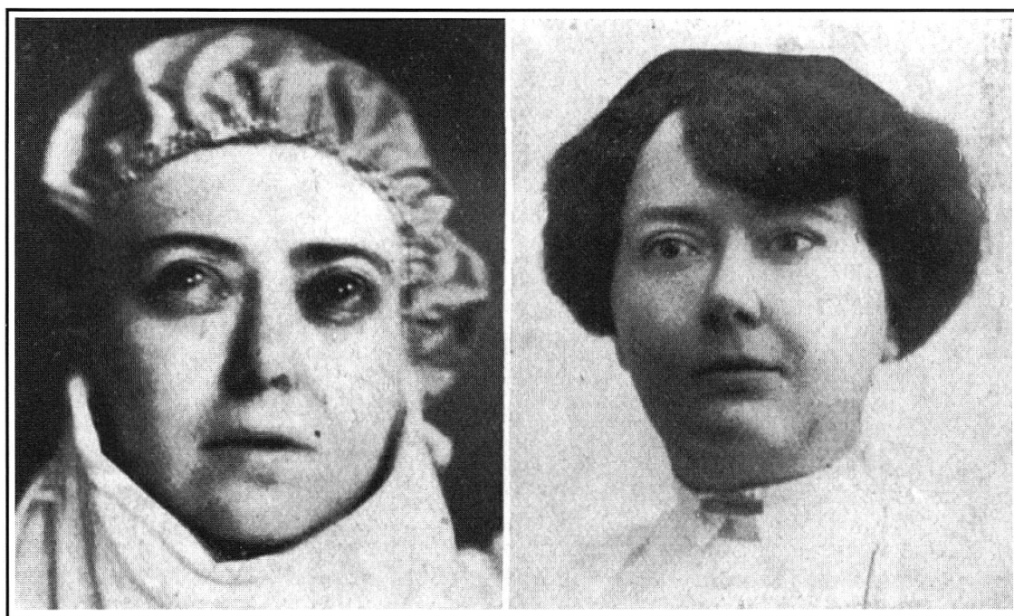
Fig. 3: Resolution of exophthalmos following thyroidectomy for Basedow's disease.

some 17 000 thyroidectomies, all with histological slides and excellent follow-up notes.