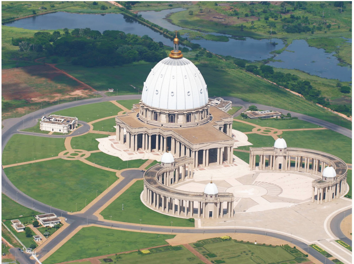
fig.1 Aerial view of Yamoussoukro's basilica, Côte d'Ivoire.

The basilica was sharply criticized in the media worldwide. Some called it an obscene gesture of waste in a country suffering from poverty. fig.2 Moreover, the project was carried