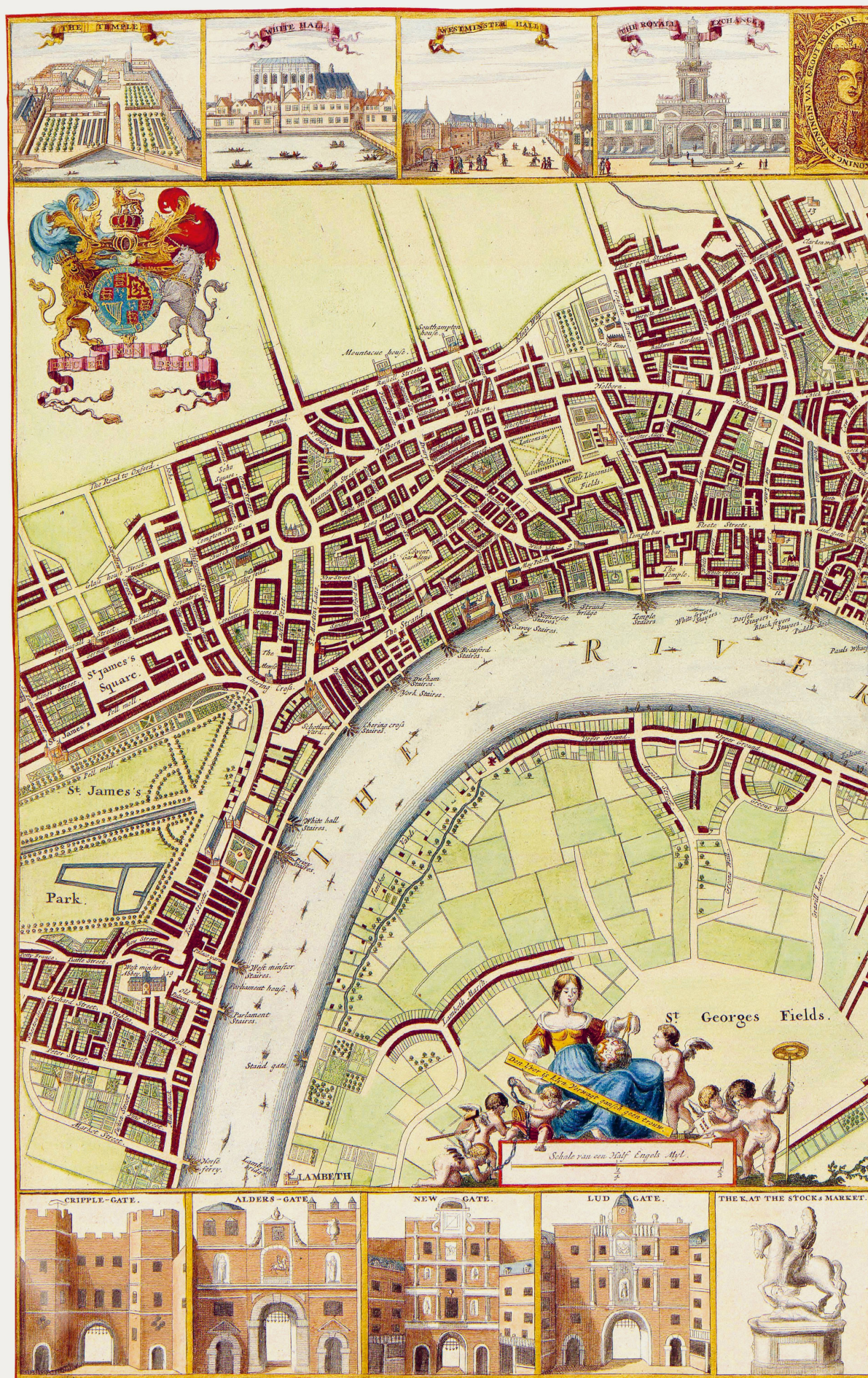
fig.1 Wenceslaus Hollar, map of London from the Atlas Van der Hagen , late seventeenth century