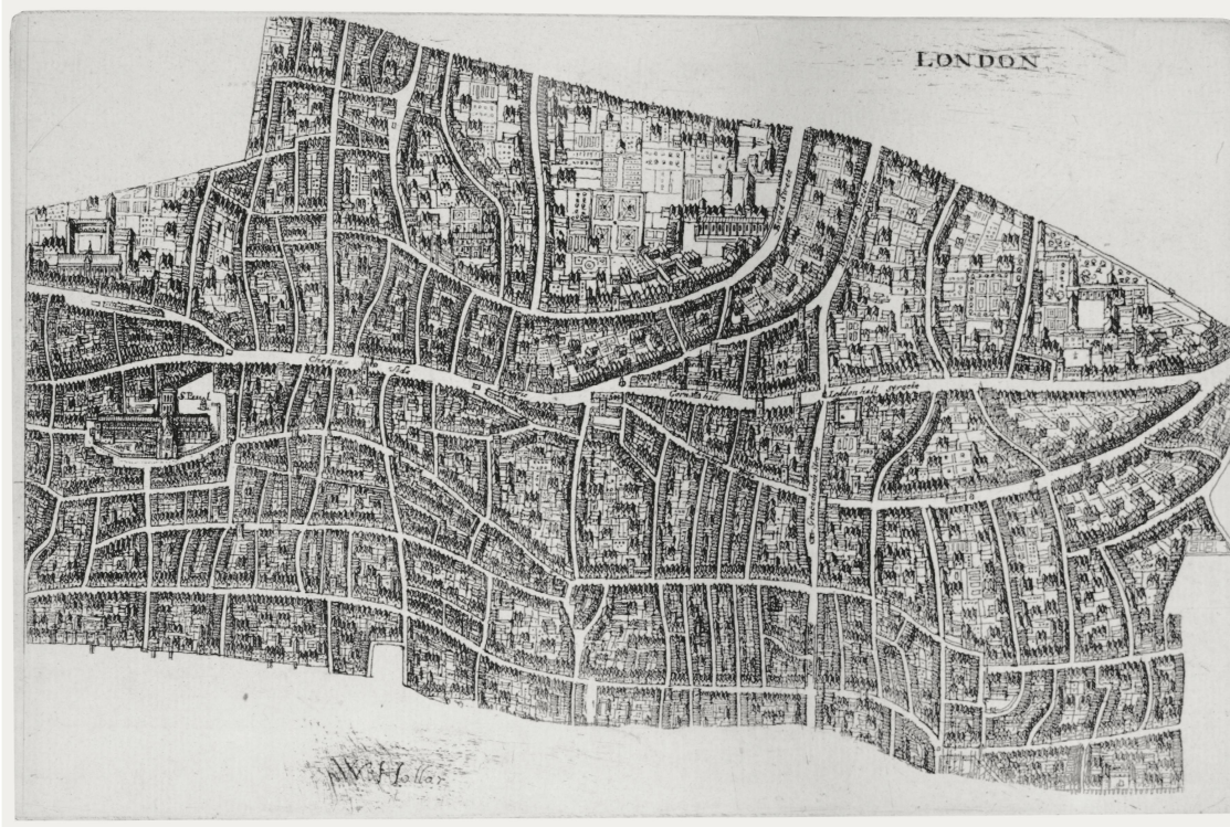
fig. 3 Wenceslaus Hollar, survey of the City of London, 1642

of households along and outside the Wall were poor, against less than 2 percent inside, an economic divide which had been growing dramatically since the previous century. 12