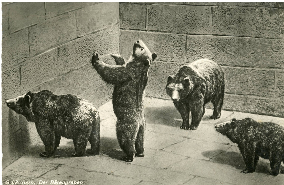
fig.1 Postcard, Bern. Der Bärengaben (the Bear Pit)