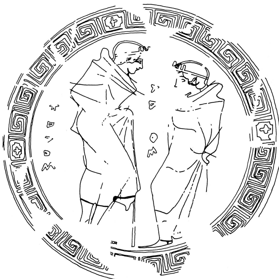
Fig. 1 Interior (actual size). Drawing by V. Uhlmann

The Painter of Bologna 417, to whom the fragmentary cup in Berne can be attributed, does not belong to what Beazley 4 calls the "lower level", though he is, to be sure, quite a mediocre artist who sporadically shows imagination in his compositions. The cup in New York (Plate 9,2;10) 5 with school girls has much charm; the tondo of a cup in Florence 6 renders the meeting of a man and a girl more suggestive through the addition of a bed. The sacrificial scenes on a cup in Florence and Greifswald 7 introduce through the capering elder a comic element somewhat at odds with the solemnity of the occasion. Humorous, too, is the disturbance brought on by the cats and mice on a pyxis lid in Berlin 8 , nor should it be forgotten that our only picture of Aesop and the fox 9 was painted by him.