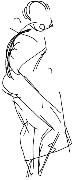
Fig. 2 Interior, preliminary sketch of left figure (actual size). Drawing by V. Uhlmann

In any investigation of the Penthesileans it is of special importance to examine how each of the twenty-odd painters of the workshop is related to the Penthesilea Painter, what he took over from the master, when he is closest to him, and when he has drifted farther away. Here the ornaments of the cups and the scheme of decoration are valuable criteria. With the Painter of Bologna 417, ten different arrangements of the handle palmettes can be distinguished. In three types the handle palmette is circumscribed: in one (type "A") the circumscribed palmette under the handle connects with two other circumscribed palmettes, one on each side of the handle, which in turn are equipped with hanging tendrils that terminate in a lotus flower 10 ; in the second type (type "B") the flanking palmettes are replaced by hanging lotus flowers 11 . In the third type (type "C") the circumscription of the palmette under the handle is pierced by the central frond, and the handles are flanked by two tendrils without palmettes or lotuses 12 .