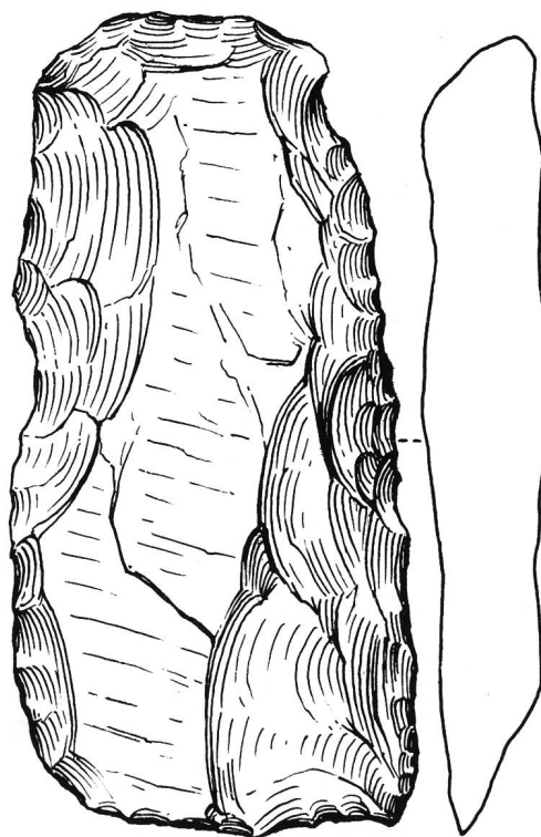
Fig. 2. Hoe from Emaokou site (scale 1:2).

The stone artifacts of Emaokou are scattered about the humus layer on the second terrace. The layer is about 2 m thick and looks greyish black and brown in colour. There is a marked undulating erosional surface between the humus layer and the underlying upper pleistocene silt layer. The humus layer contains a large amount of stone tools. Going up river along the Big and Small Guadigou, we may see more and more stone artifacts and piles of them at the source of the two coombes. It is beyond doubt that the age of the humus layer on the erosional surface belongs to the early period of the Holocene, and the stone tools therein must be remains of the early neolithic age. So this site should be earlier than Hemudu. Furthermore, a layer of diluvial and drift soil, about only 0.5 m thick, can be seen on hills near the site. Abundant stone artifacts were discovered in this layer. No vertebrate fossils have been found together with the stone remains, nor were any other cultural