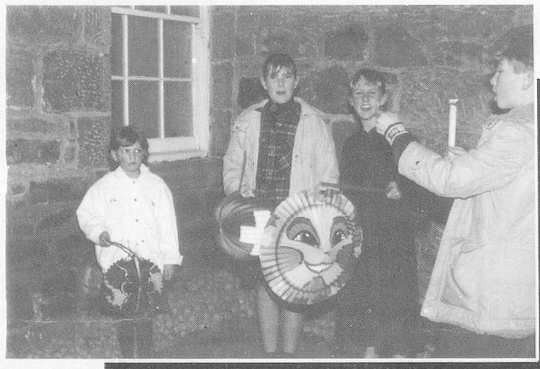
Children with their 'lampions' braving the cool winter air to watch the traditional fireworks.