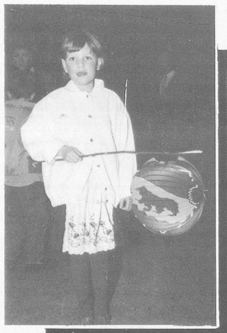
No prizes for guessing where her dad comes from.