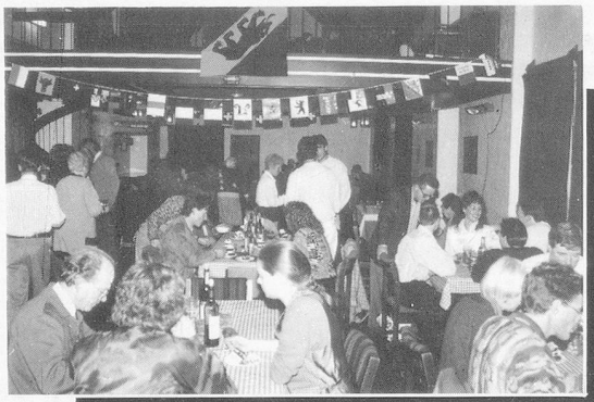
A good time to catch up with old friends, and make some new ones.

I am looking forward to seeing you all at some of the events coming up! Please mark your diary or calendar right now - we will NOT ring everybody anymore to remind them (as we used to do in the past).