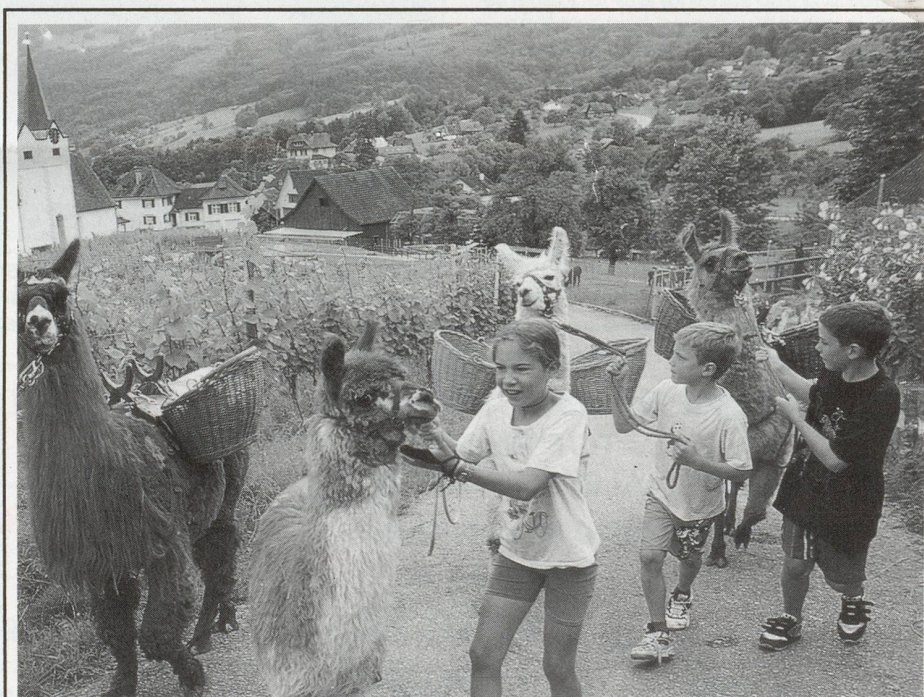
The highlight of the day for the kids: a hike into the St Gallen vineyards with some of the llamas that carry the food for the pic-nic in the baskets slung over their backs.

Needless to say that the children really love these types of outings. However, the zoo keepers are very careful that the animals do not get stressed by the presence and attention of the children. The interaction between children and animals is carefully assessed so that none of them get tired or fed up with the others.