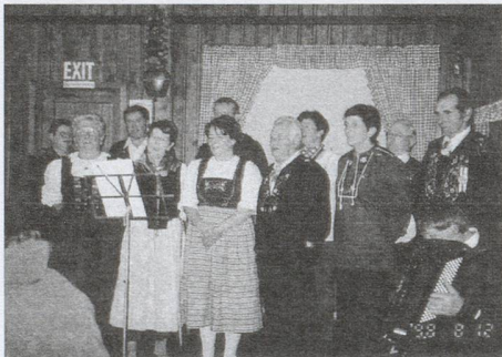
The singing group performing on the 1st August 2008

This year we held the Swiss National Day celebrations on the actual day - 1 st August - with an excellent crowd of approximately 85 adults and children. Many people wore Swiss costumes, which helped create a great atmosphere and made the hall look very colourful. All our sixty 1 st August badges were sold, amid people having a glass of wine or beer with lovely traditional background music. The table decorations were lovely, and brought even more colour to our nice hall. The formalities of the evening commenced, with the speech from the President of the Confederation, Mr Pascal Couchepin, which was short, informative and interesting, fol-