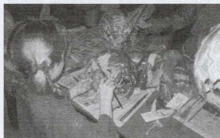
All concentration to create a colourful lampion

On 13 and 20 July some of the young families within the club came together to work on homemade lampions in preparation for the 1 st August celebrations. A great range of colourful designs emerged from the piles of pieces of paper and the paste and paint bottles.