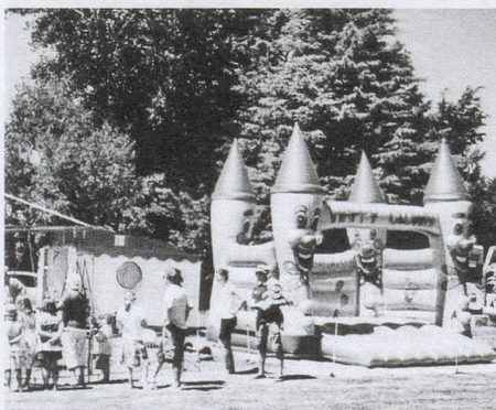
The amusements enjoyed by many children were truly appreciated