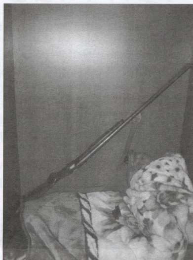
The gun in the wardrobe in Albania

Albania were heavy with litter, Bulgaria tidier and Romania tidier still. Of course, people have their stereotypes