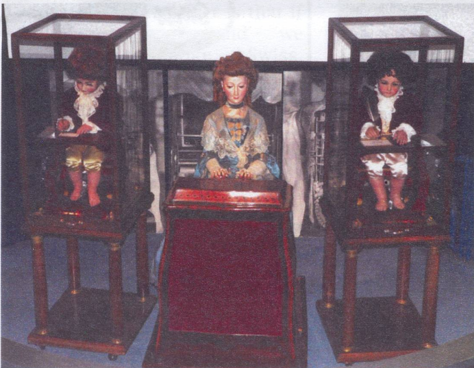
The draughtsman, the writer and the musician by Pierre Jaquet-Droz

The star attractions of this museum are the three mechanical figurines built to the most exacting technical standards by a Neuchâtelois watchmaker in the 1770s and still in perfect working order today. The three – the Draughtsman, the Writer and the Musician – are displayed static behind glass, with a fascinating accompanying slide-show in English by way of explanation, but if you can you should really time your visit for the first Sunday of the month, when they are brought to life for a demonstration. The Draughtsman is a child sitting at a mahogany desk and holding a piece of paper with his left hand; his right hand, holding a pencil, performs extraordinarily complex motions to produce intricate little