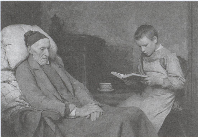
Die Andacht des Grossvaters

In 1870-74 he was a member of the Grand Council of Bern, where he advocated the construction of the Kunstmuseum Bern.