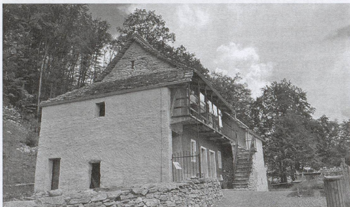
18th century house from Cugnasco/TI

A few people huddle around the burning embers: an old woman is sitting on a wooden bench, a man and a couple of barefoot toddlers are standing close to her. The door is kept ajar to let out the choking smoke.