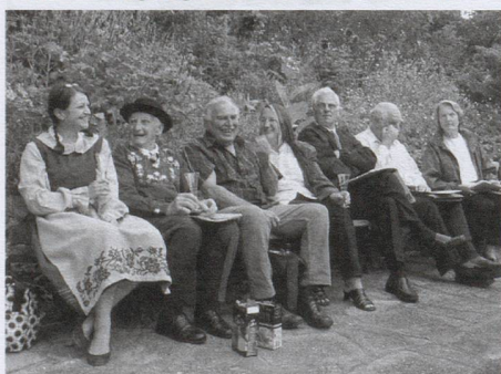
Warming up (with schnapps) while waiting to sing

Sunday, 12 th December: Carol Singing. We'd also had a fine time singing old favourite carols