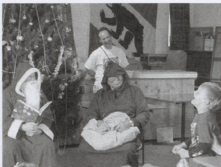
Samichlaus, Schmutzli and friends