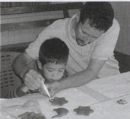
Father and son team up

After last year's attendants had set the bar incredibly high with regards to decorating excellence, the registrations for this year's Läbchueche Decorating were trickling in rather slowly. But a last minute surge in participants meant that 21 big and