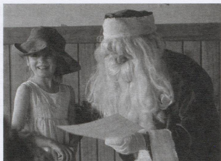
A happy child

greeted by delighted children, parents and friends. In his usual professional way he talked to over 60 children at their own level, brought them lots of joy, and a Santa bag. More than ever