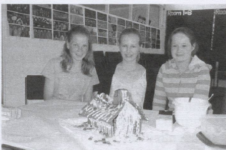
Girls admiring the decorated Gingerbread House before it collapses

Christmas Party for Families was held on Sunday 5 December at the Newstead School. We had a great turnout with lots of families from near and wide. It was another beautiful summer's day so the children could enjoy the huge adventure playground and play games out in the field. For those wanting to do something more creative, there were activities organised inside. Again we had baked Christmas Trees and Gingerbread Men to decorate as well as cards to put together. There was also a Gingerbread House to decorate but this started to collapse before we finished decorating it. Everyone had fun and it also tasted good.