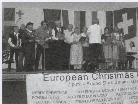
Swiss Choir and German friends performing at the Soundshell