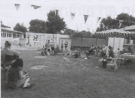
Santa comes to watch the pantomime before he hands out the presents.