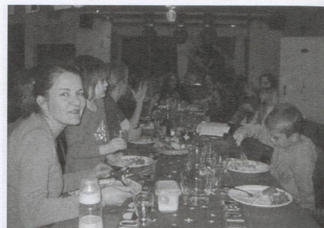
Beautifully decorated tables

Theres had cooked delicious pastetli (vol-aux-vents), filled with chicken, mushrooms – and a