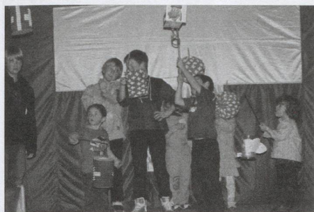
Weiss nicht, ob das von Auckland ist.

feel real with their Lampion - Parade, and their parents who got them all organised.