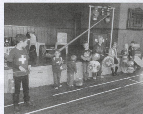
The next generation

prizes. We also had quite a few children who brought along their lampions so a group of children came up to the stage for a small parade. Great to see so many new young faces.