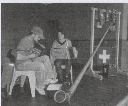
Our young musicians

Again we chose to have our National Day celebration on a Sunday as last year's lunch-time function proved to be very popu- lar. We had about 100 members and friends turn up promptly at the Matangi Hall and after a brief welcome by the president everyone was ready to queue up for their buffet lunch. We had copious supplies of sauerkraut, potatoes, speck, ham and two types of sausages. No one went hungry and most people had a chance to come back for sec- onds. There were lots of com-