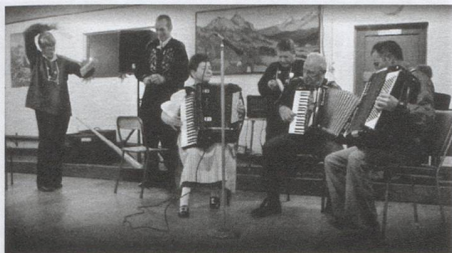
Our home-grown entertainment...