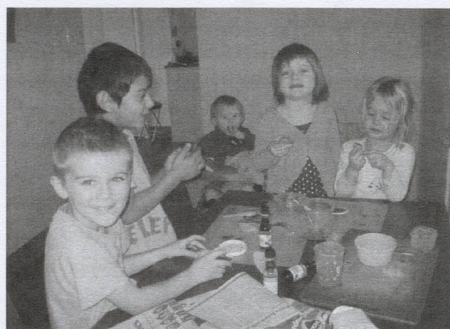
Eating our artwork

20 th July – We had one of our (almost) regular "Krabbel-gruppe" (understand "coffee group") on Wednesday 20 th July. We were four mums and 9 kids, ages ranging from five months to six years.