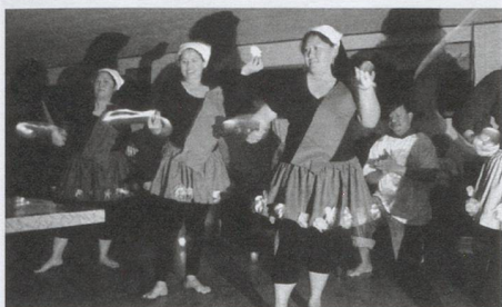
... and a Philipino performance