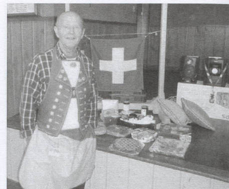
What a selection

Before the speech everyone had the opportunity to buy raffle tickets and these were drawn fairly promptly and many people were lucky to win one of many donated prizes. Many thanks to everyone who bought tickets and to all those that donated