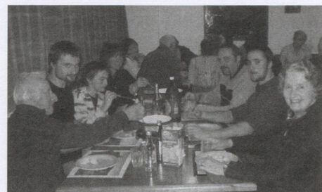
The main medal winners...