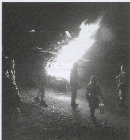
The big fire on Petone Beach

for the children so they were able to roast marshmallows. Many had brought their lanterns. Someone had the great idea to bring sparklers, which was a big success with the younger members.