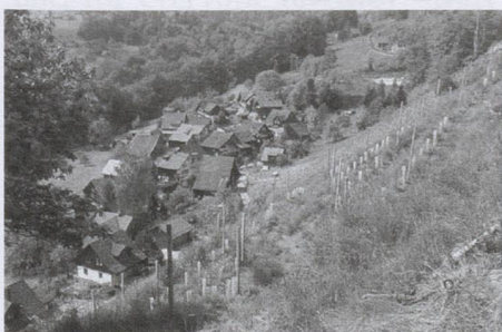
Wienacht-Tobel with vineyard; the AR wine grows here

Everybody knows when Wienacht, Christmas, is - but do you know where it is? Geography was never my strongest subject, but I know where Wienacht is, as I grew up within walking distance of this 'Heritage Site of National Significance'. It is half way between Rorschach and Heiden (whose Biedermeyer village around the church square is listed as another heritage site of national significance).