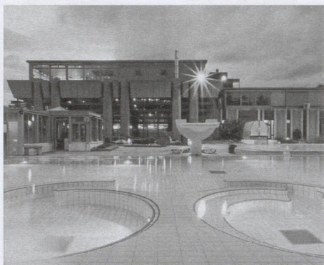
Thermal Centre at Yverdon-les-Bains

The springs were probably known and used even before the Roman era, at the time of the Helvetii, when the springs were a sacred place. Documents from the Middle Ages prove the existence of a spa centre as early as 1429, and mention several buildings.