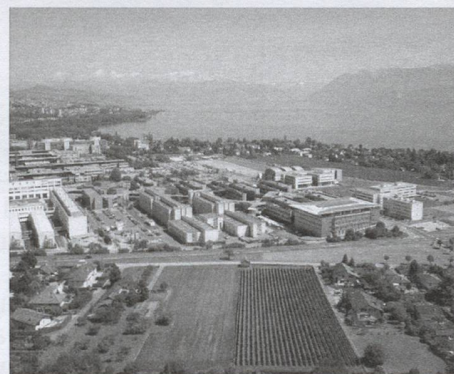
Ecole Polytechnique Fédérale

The Ecole Polytechnique Fédérale de Lausanne (EPFL) is one of the two prestigious Swiss Federal Institutes of Technology. From its foundation in 1853, EPFL has evolved into a strategic centre of innovation in Switzerland and an internationally recognized institution. Nowadays, it regularly ranks among the best universities in Europe and in the world in academic rankings. Over the years, EPFL has become increasingly international, recruiting the best students and outstanding faculty worldwide. With 112 nationalities on campus, 50% of its faculty and 60% of its PhD students from abroad, no wonder EPFL has been ranked one of the most international campuses by the Times of Higher Education Supplement.